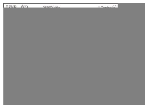
Wave Soldering (Flow Soldering)