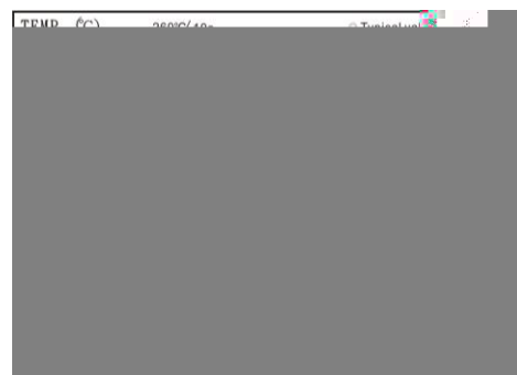
Wave Soldering (Flow Soldering)